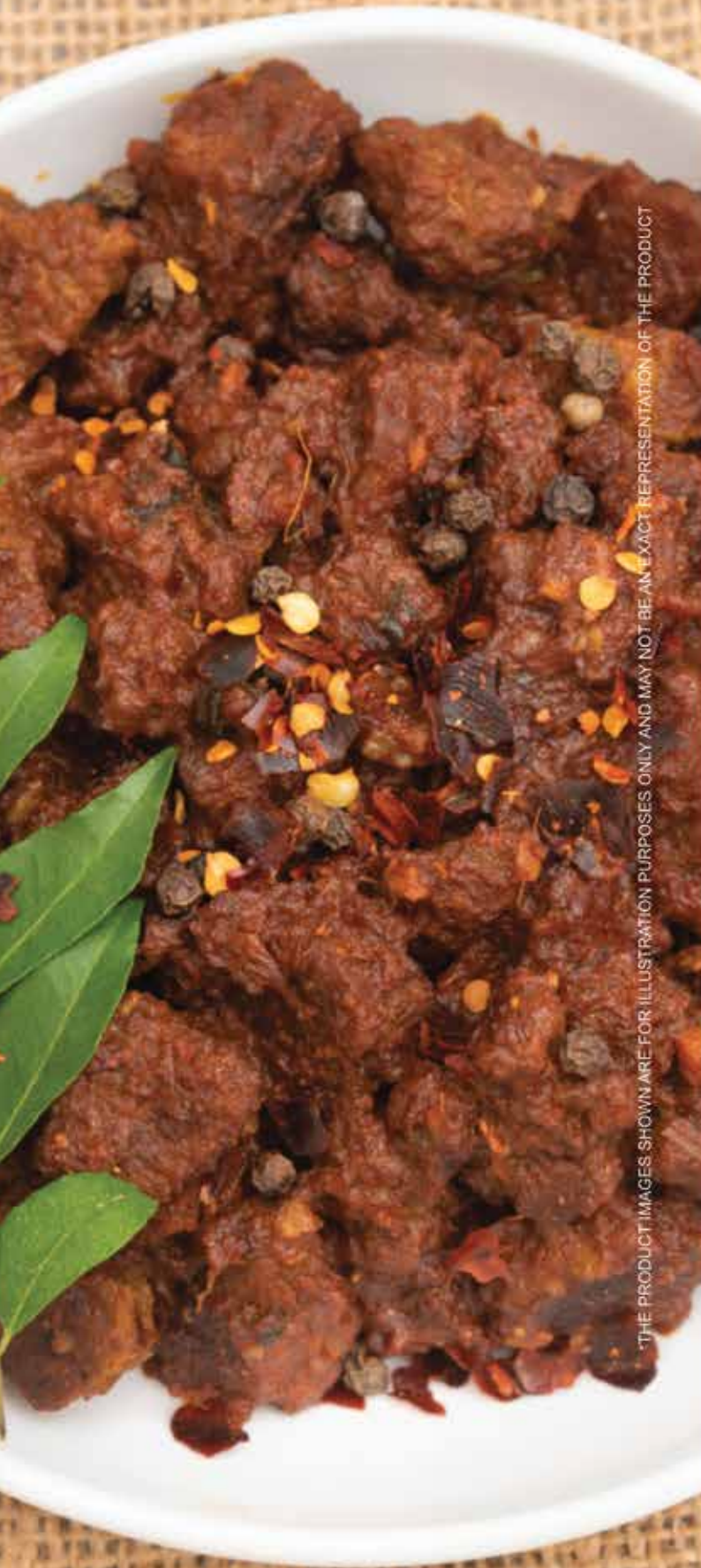
THE PRODUCT IMAGES SHOWN ARE FOR ILLUSTRATION PURPOSES ONLY AND MAY NOT BE AN EXACT REPRESENTATION OF THE PRODUCT